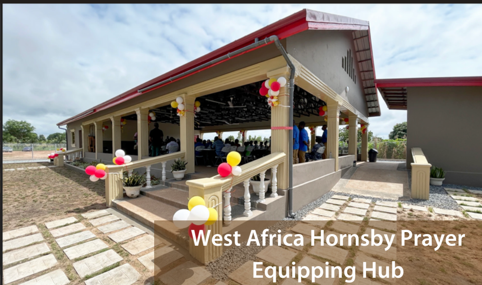
West Africa Hornsby Prayer Equipping Hub