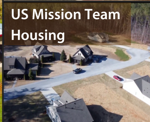
US Mission Team Housing