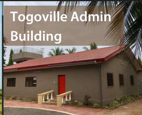
Togoville Admin Building