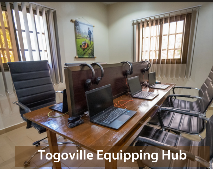
Togoville Equipping Hub